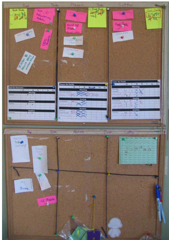
Figure 5. Family Task Boards